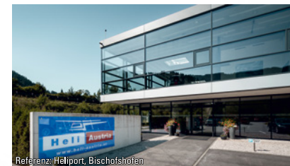
Referenz: Heliport, Bischofshofen