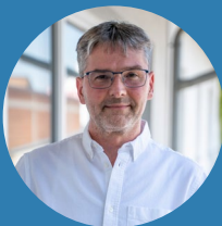
Helmut Hartner Warehouse